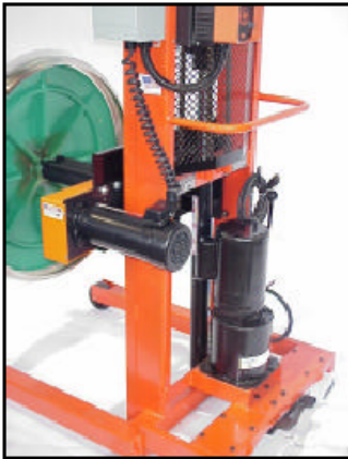
Very stable base assembly